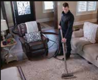
CARPET & AREA RUGS