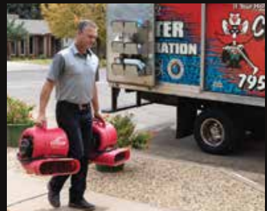
FLOOD & FIRE RESTORATION