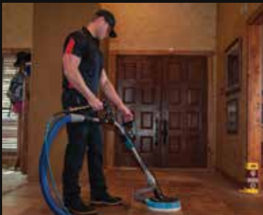
TILE & GROUT