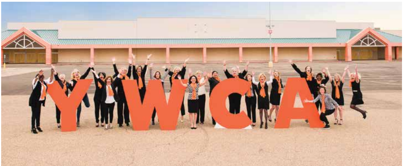
2018 YWCA Board after aquisition and before renovation.

Women are just in tune with what is needed and they are always looking to the future! That's why we are so proud of our YWCA Board---it's a diverse group but yet, they share a common love for helping the community. By getting to know our leadership, you may just decide the YWCA is the organization you've been wanting to find.